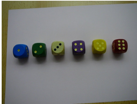
Fig. 2: Iconic representations of natural numbers on dice

Symbolic representations describe phenomena and relationships with language, e.g. using a mathematical symbolical language (mathematic symbols). “4” is a symbolic representation of number four. The use of symbolic representations means a deviation from imminent physical reality, it is therefore a representation mediated by abstract terms and categories.