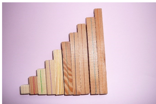
Fig. 3: Modified Cuisenaire rods

An experiment was carried out in the first year of elementary school, whose subject were the strategies used by pupils (6-7 years of age) during the manipulation with Cuisenaire rods. The aim was to discover, which strategies were applied by 1 st year pupils during the enactive representation of number 4, number 5, number 6, number 9 and number 11 by the means of Cuisenaire rod manipulation. Our task was to select suitable tools for the enactive representation of a number and to build a series of activities to motivate children and simultaneously to discover their strategies applied during the enactive representation of above-mentioned numbers.