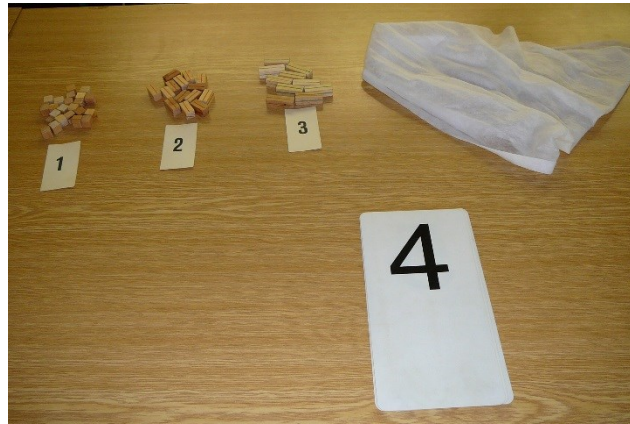
Fig. 4: Tools for first-year experiment

To illustrate how single tasks were presented to children, we describe here in detail the presentation of Task 1, which was motivated as follows. (If subsequent sentence begins on next line, it means that the child was given space for reaction). Occasional deviations tried to accommodate different children's personalities and their spontaneity.)