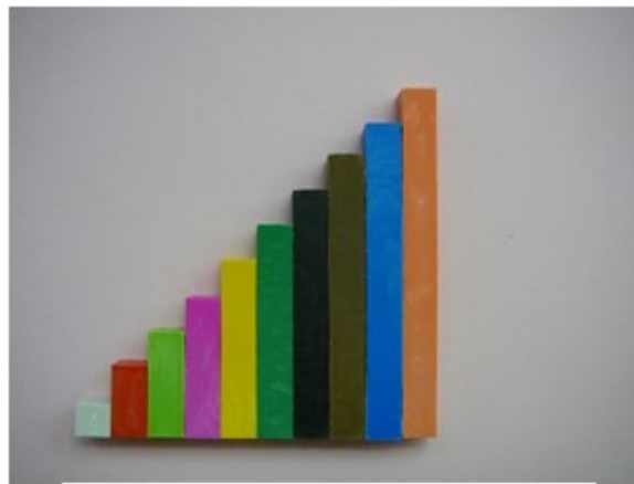
Fig. 1: Cuisenaire rods

Iconic representations encompass the use of various substitute models of reality such as images, schemes and concepts. Numeric figures of natural numbers 1 – 6 on a die are an example of iconic representation (in Fig. 2). Kaslová (Kaslová, 2010) classifies these figures among natural number models and calls them “configuration models”.