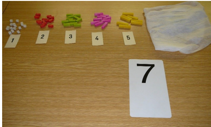
Fig. 5 Desk with tools prepared for 2nd year experiment

The pupils were asked to perform the enactive representation of eight numbers in the 1-100 category, where both odd and even numbers were represented. Table 4 contains information on the types of rods used by pupils for the enactive representation of given numbers. The script of information on used rods corresponds to the script of number(s) they were used for.